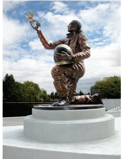
finished statue dedicated June 12, 2005