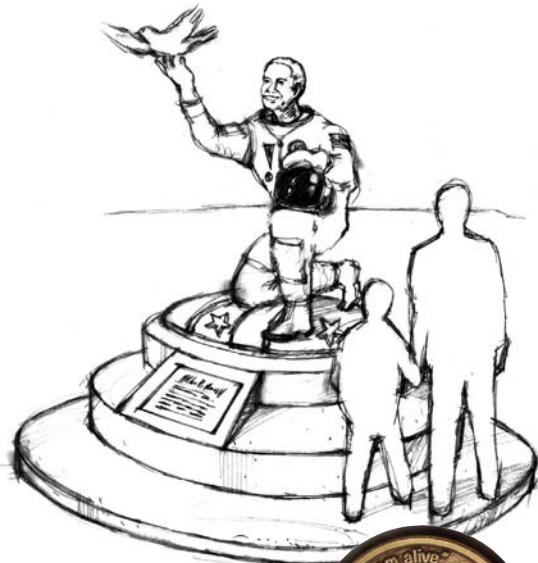
preliminary concept sketch