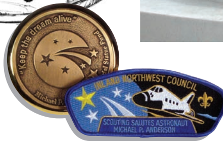
commemorative coaster and scout patch