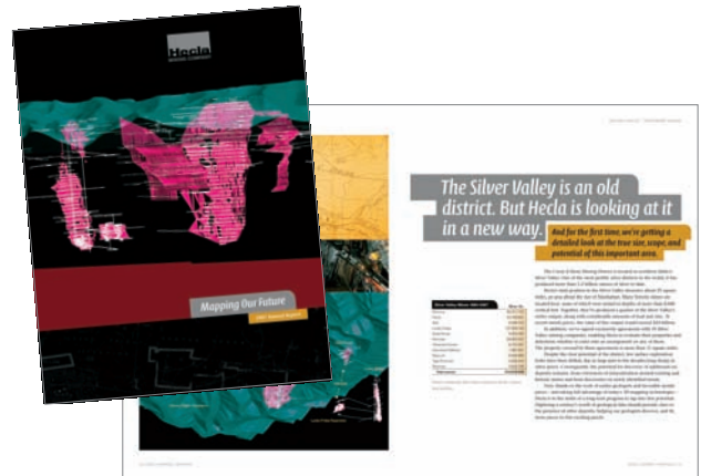
hecla annual report – silver addy