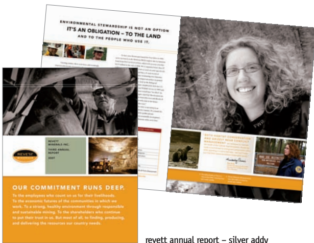
revett annual report – silver addy