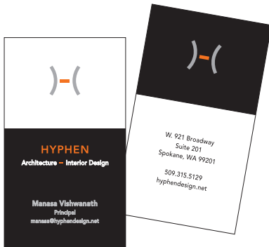
hyphen logo & stationery – gold addys