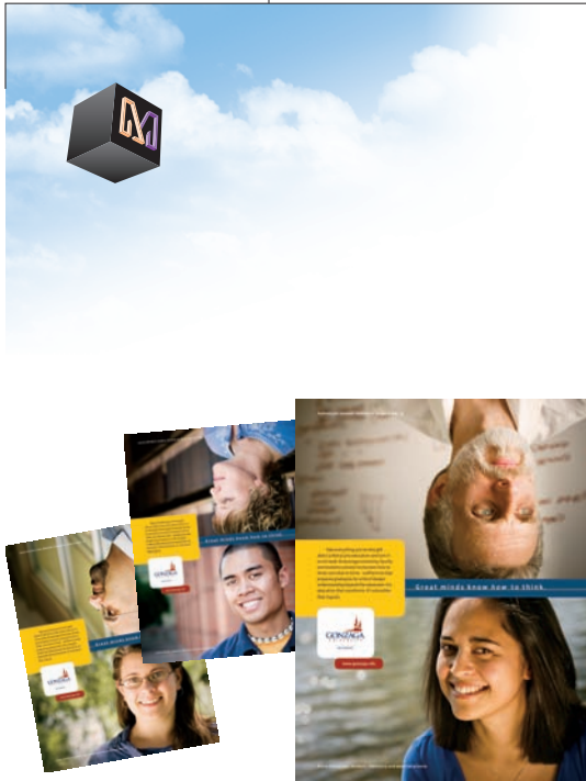
gonzaga university advertising campaign – silver addy