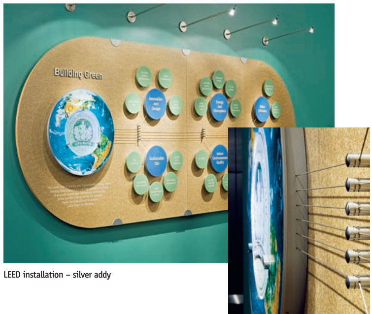
LEED installation – silver addy